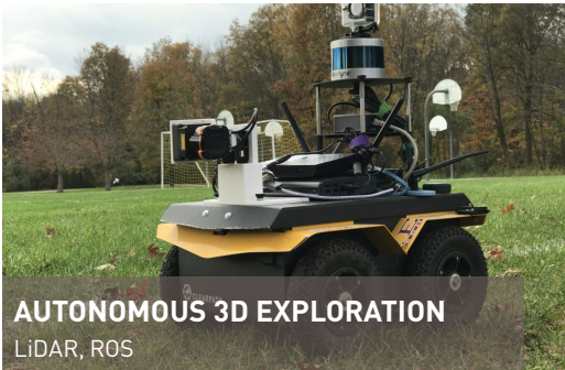
AUTONOMOUS 3D EXPLORATION LiDAR, ROS