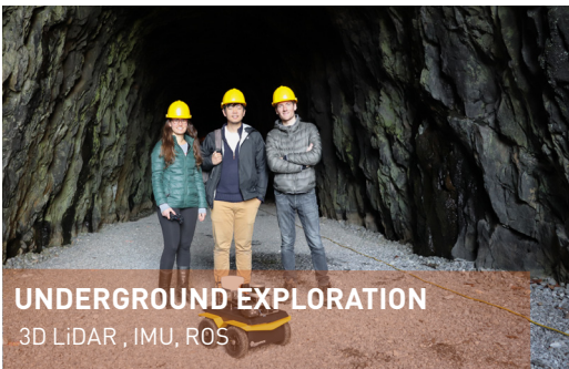
UNDERGROUND EXPLORATION 3D LiDAR, IMU, ROS